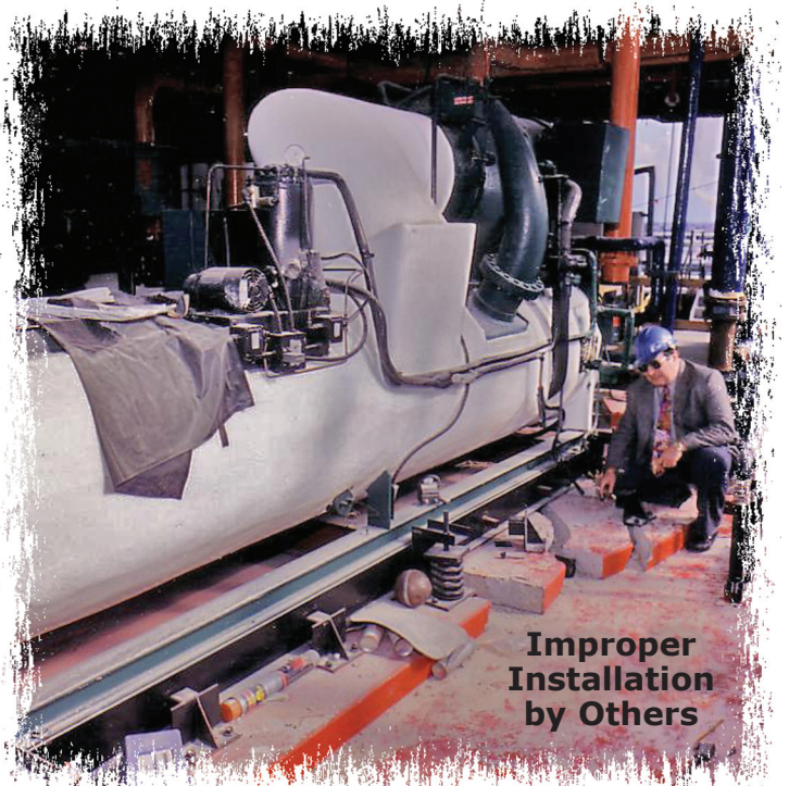
Improper Installation by Others

Click Here to View a Complete Pictorial Study of Seismic Damage and Use of Proper Safeguards.